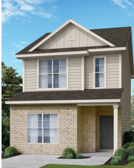
Elevation B5 with 3rd BR

Two-Story Home 3 Bedrooms, 3.5 Baths Approx. 1,459 sq. ft. heated